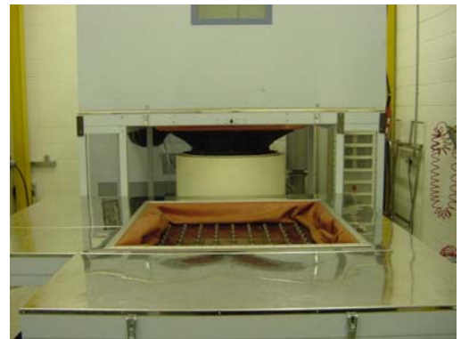
Shaker, head expander and slip table at Autoliv