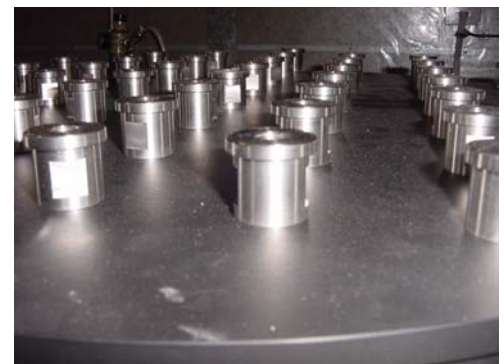
Raised insert for push on foam thermal barrier