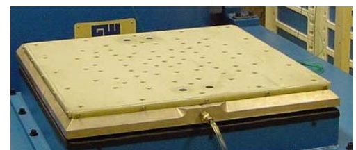
Slip table thermal barrier with edging strips to secure the chamber floor diaphragm