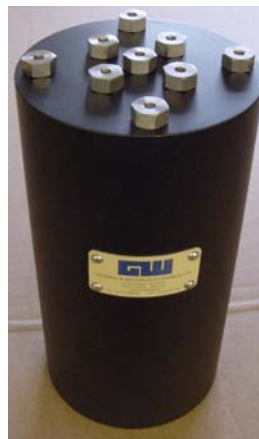
Small shaker head extender