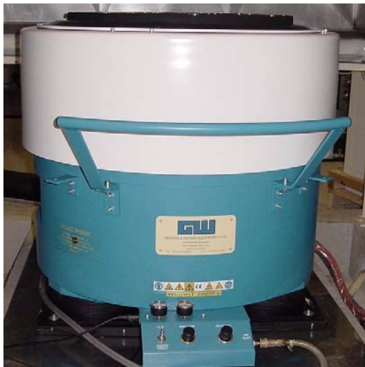
V26 shaker showing guidance handle, foam thermal barrier and air glides.