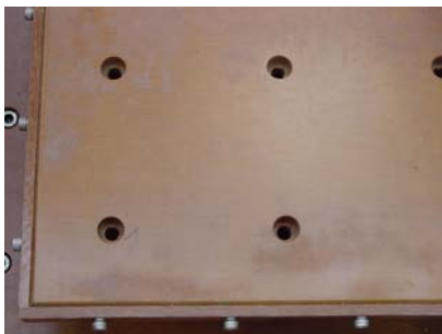
Phenolic thermal barrier showing side clamping strips on each edge for chamber floor diaphragm.